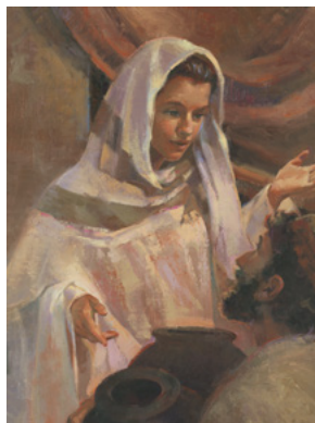
Illustration by Dilleen Marsh

Mary's position at the wedding was likely one of responsibility. 2 When