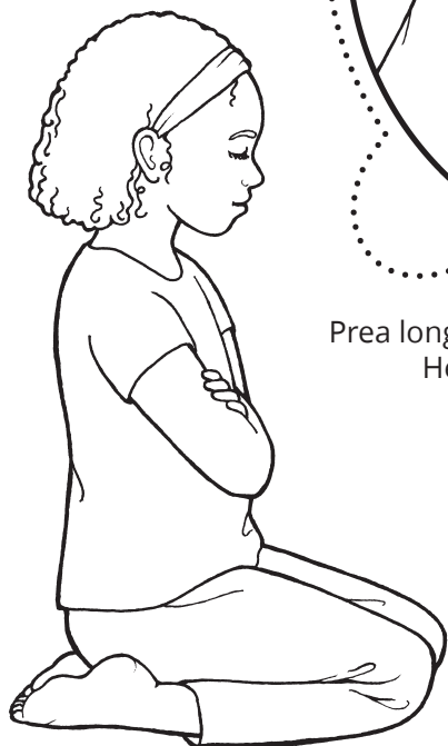
Prea long Papa long Heven