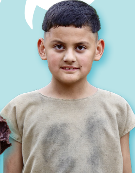
Kwomaroḡ kwaļok pija in alooḡ eo ippān aolep! Castle W., iiō dettan 9