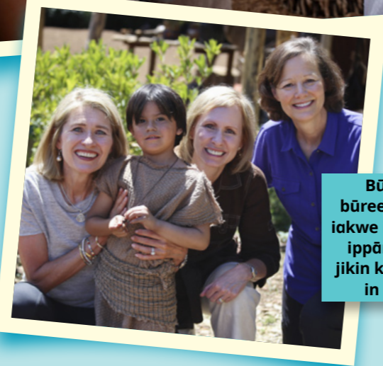
Būraimere būreejtōnḡi eo rej iakwe ioon kweilok ippān ajri ro ilo jikin kōmḡman pija in alooḡ eo.