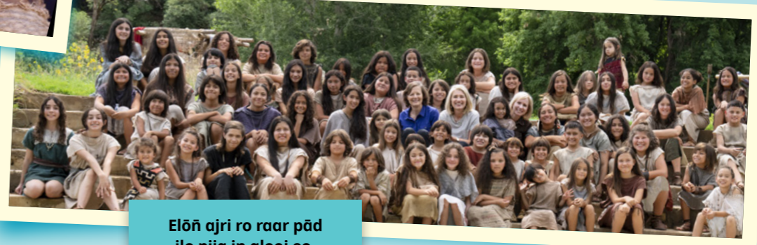
Elōḡ ajri ro raar pād ilo pija in alooḡ eo.