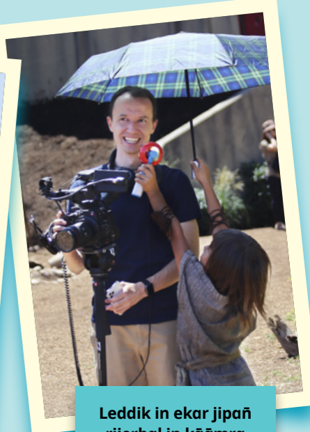
Leddik in ekar jipaḡ rijerbal in kāāmra eo pād ilo aemḡoļo.