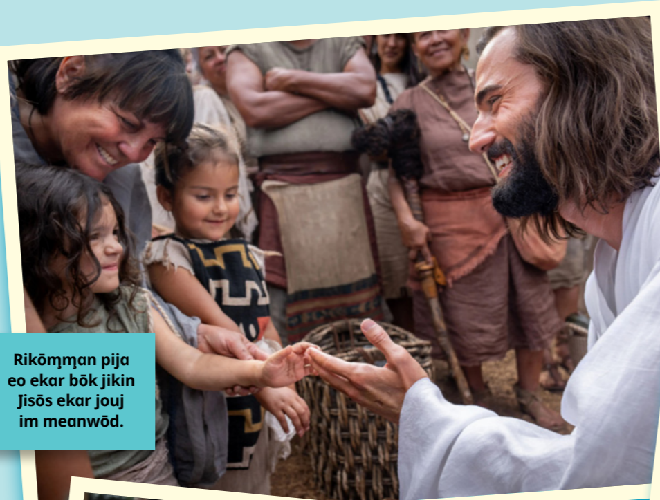
Rikōmḡman pija eo ekar bōk jikin Jisōs ekar jouj im meanwōd.