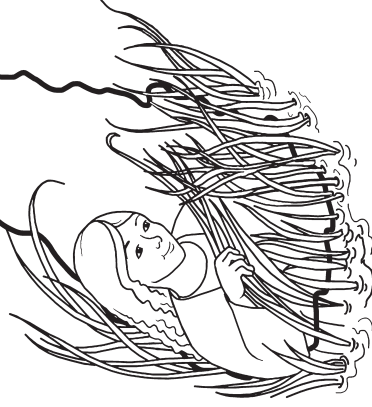
Miriam, lio jatin Moses (Exodus 2:4-8)