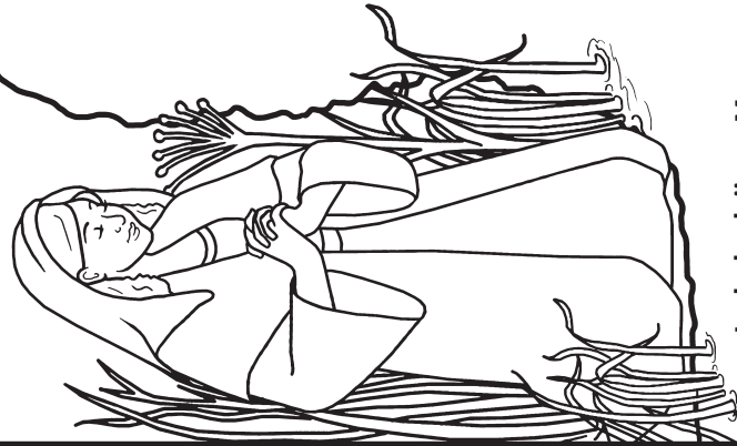
Jochebed, jinen Moses (Exodus 2:1-3)