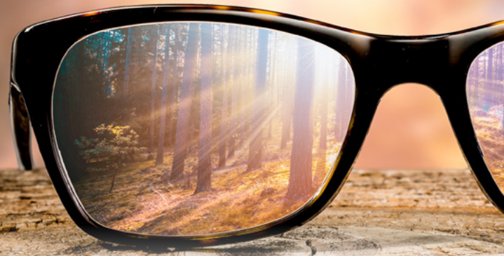
Presiden Russell M. Nelson, “Joy and Spiritual Survival,” Oct. 2016 general conference ( Ensign o Liahona , Nov. 2016, 82).

“GLAD WE YUMI FILIM I NO FROM SITUESEN BLONG LAEF BLONG YUMI, BE HEM I FROM SAMTING WE YUMI LUKLUK FASWAN LONG LAEF BLONG YUMI.