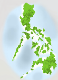
The Philippines has more than 7,600 islands!