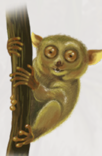
The country is home to 70% of the world's plant and animal species.