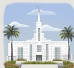
Soon the Philippines will have eight temples.

Felipe knew it was getting late. The birds had stopped chirping, and the crickets were humming loudly. He and his mother had walked in the forest for more than two hours. But each path they took looked the same as the last. They were completely lost.