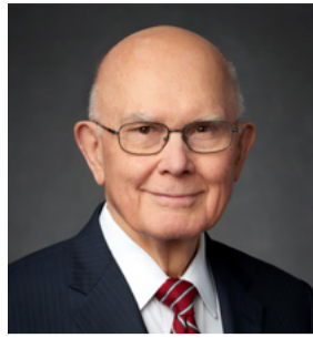
Dallin H. Oaks Tauturu hō'ē