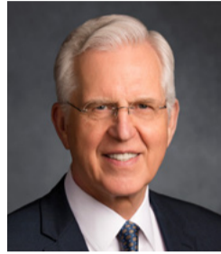
D. Todd Christofferson