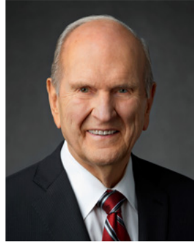
Russell M. Nelson Peresideni