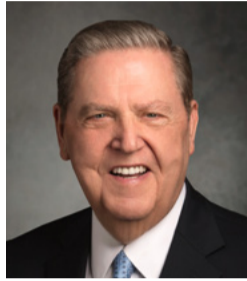
Jeffrey R. Holland