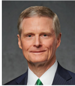
David A. Bednar