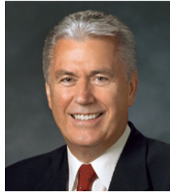
Dieter F. Uchtdorf