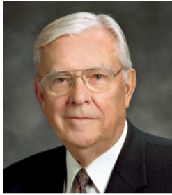
M. Russell Ballard