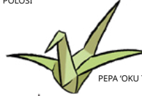
PEPA 'OKU TĀPELUPELU KE NE FAKATAIPE HA FA'AHINGA ME'A