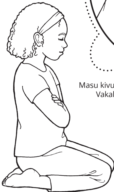
Masu kivua na Tamada Vakalomalagi