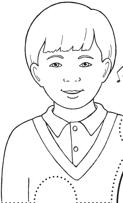
Caka veiyalayalati kei na Tamada Vakalomalagi